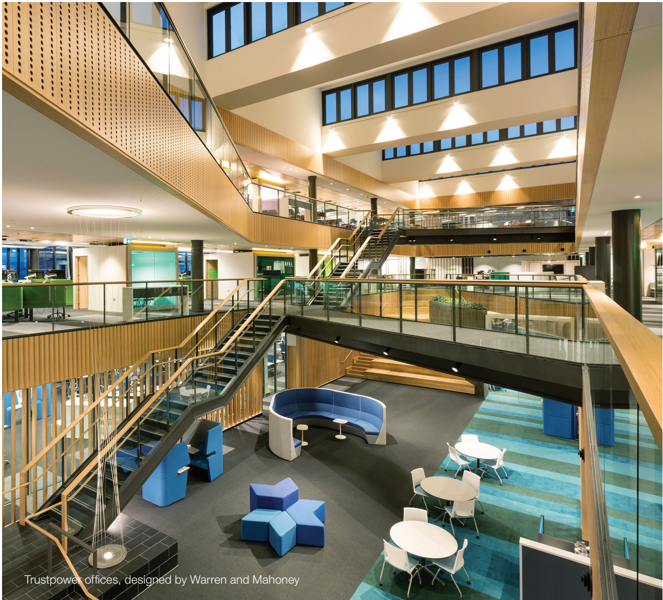
Trustpower offices, designed by Warren and Mahoney